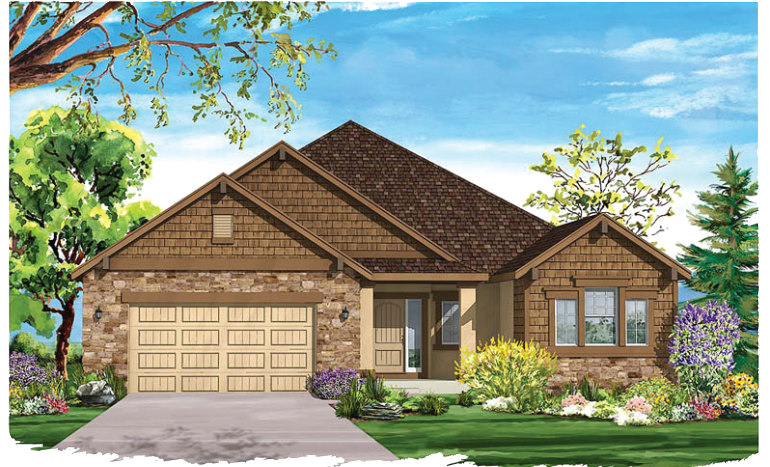
ELEVATION 'K' W/ OPTIONAL STONE