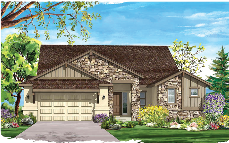
ELEVATION 'M' W/ OPT. STONE & OPT. 3-CAR GARAGE