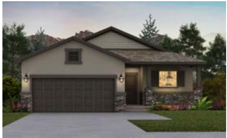
ELEVATION E w/ opt. stone & covered porch