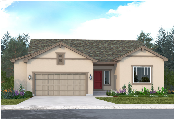
ELEVATION C w/ opt. 4' garage extension

Main Level: 1,950 sq. ft. Lower Level: 1,952 sq. ft. Total: 3,902 sq. ft.