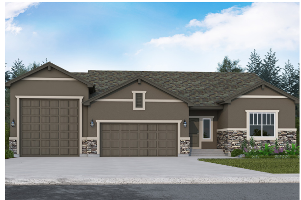
ELEVATION C w/ opt. RV garage and opt. stone

*RV Garage not available in all communities - See Sales Associate for details