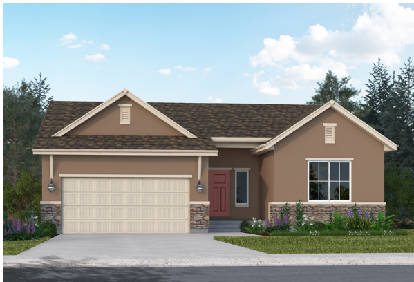
ELEVATION F w/ opt. stone