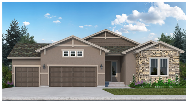
ELEVATION E w/ opt. 3-car garage and opt. stone