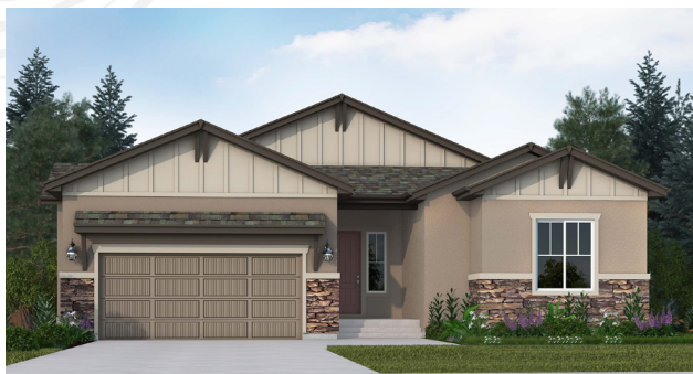
ELEVATION C w/ opt. stone

Main Level: 2,188 sq. ft. Lower Level: 2,172 sq. ft. Total: 4,360 sq. ft.