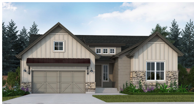
ELEVATION F w/ std. stone