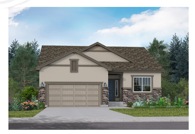
ELEVATION C w/ opt. stone

Main Level: 1,623 sq. ft. Lower Level: 1,624 sq. ft. Total: 3,247 sq. ft.