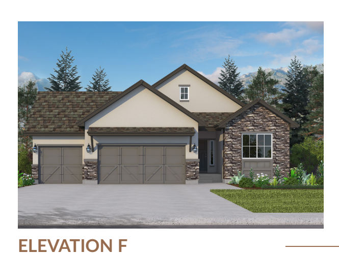
w/ opt. 3-car garage and opt. stone