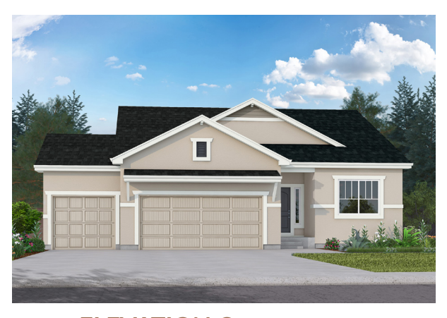
ELEVATION C w/ opt. shed roof and opt. 3-car garage