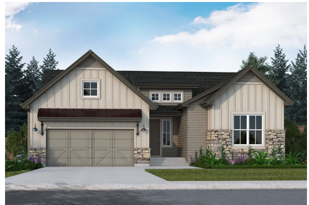
ELEVATION F w/ std. stone