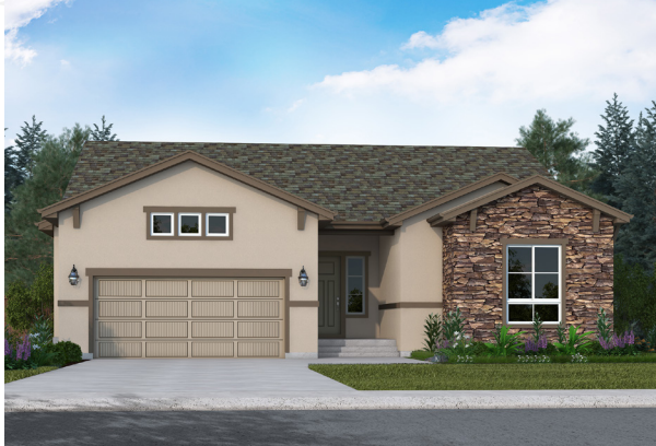
ELEVATION B w/ opt. stone

Main Level: 2,188 sq. ft. Lower Level: 2,172 sq. ft. Total: 4,360 sq. ft.