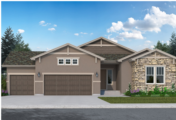
ELEVATION E w/ opt. 3-car garage and opt. stone