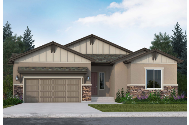
ELEVATION C w/ opt. stone