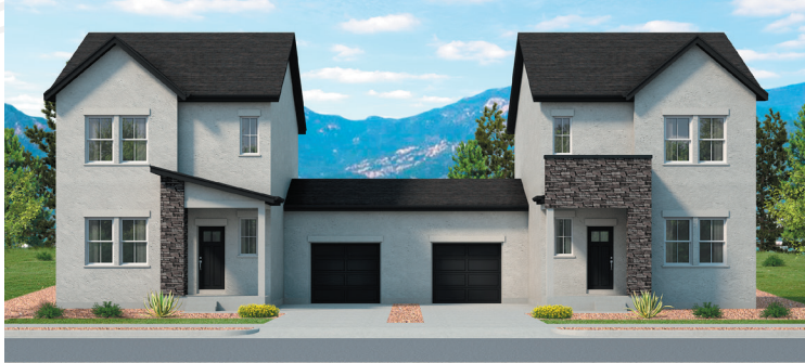
ELEVATION A w/ standard stone

Main Level: 805 sq. ft. Upper Level: 805 sq. ft. Total: 1,610 sq. ft.