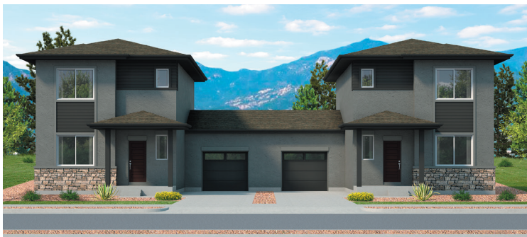
ELEVATION C w/ standard stone