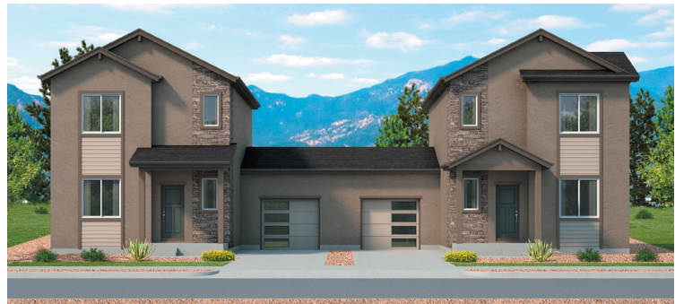
ELEVATION B w/ standard stone