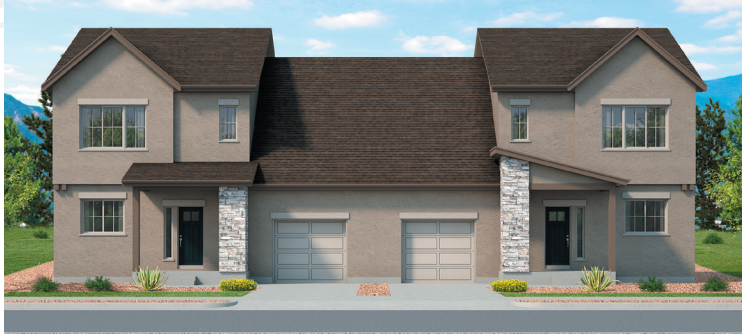
ELEVATION A w/ standard stone

Main Level: 792 sq. ft. Upper Level: 1,034 sq. ft. Total: 1,826 sq. ft.