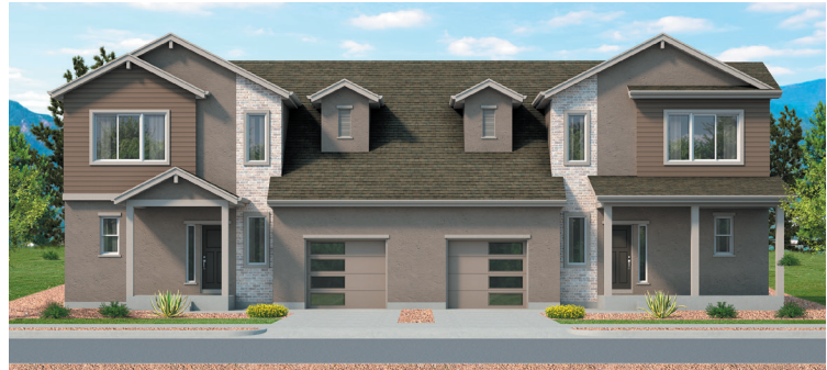
ELEVATION B w/ standard stone