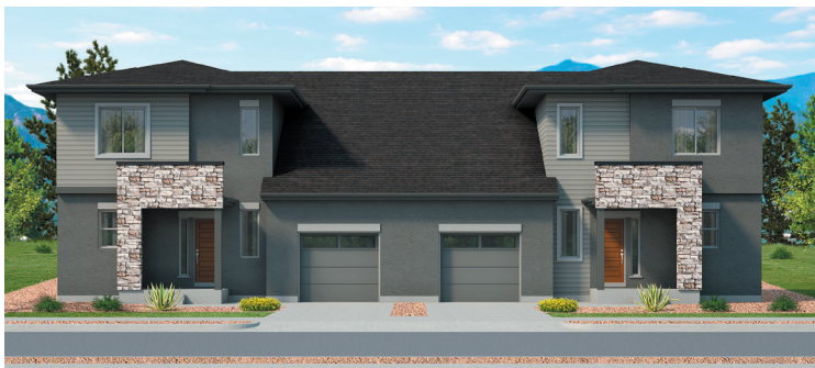
ELEVATION C w/ standard stone