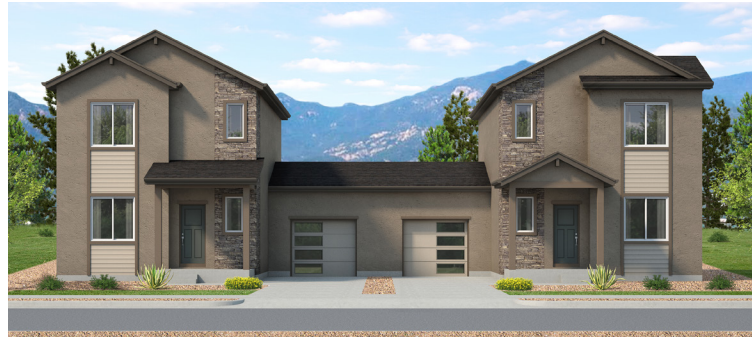
ELEVATION B w/ standard stone