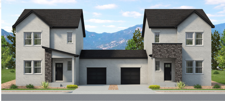
ELEVATION A w/ standard stone

Main Level: 805 sq. ft. Upper Level: 805 sq. ft. Total: 1,610 sq. ft.