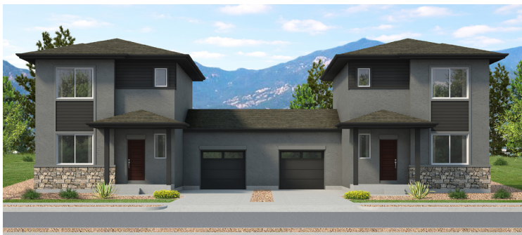
ELEVATION C w/ standard stone