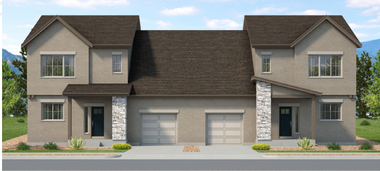
ELEVATION A w/ standard stone

Main Level: 792 sq. ft. Upper Level: 1,034 sq. ft. Total: 1,826 sq. ft.