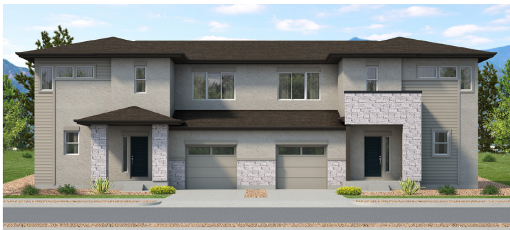
ELEVATION C w/ standard stone