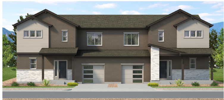
ELEVATION B w/ standard stone