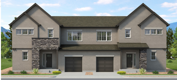
ELEVATION A w/ standard stone

Main Level: 792 sq. ft. Upper Level: 1,166 sq. ft. Total: 1,958 sq. ft.