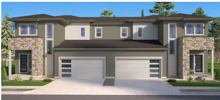
ELEVATION C w/ standard stone