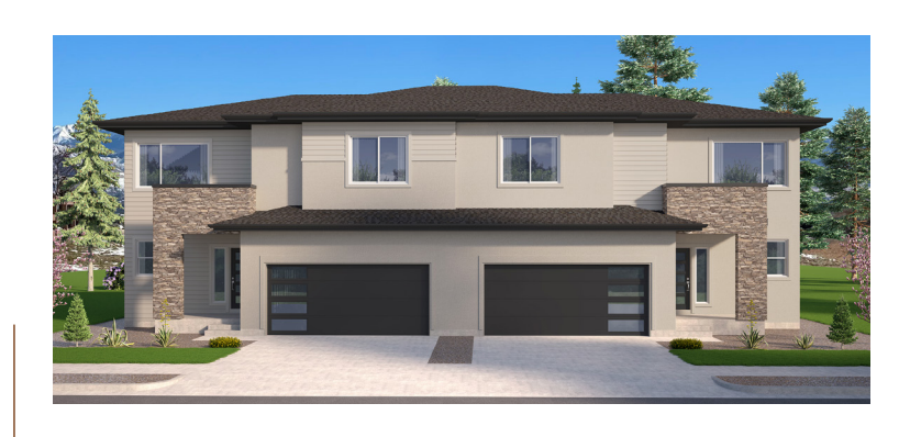
ELEVATION C w/ standard stone