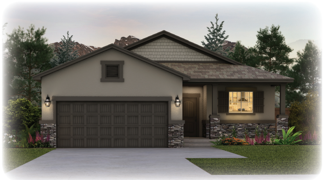
ELEVATION E W/ OPTIONAL STONE